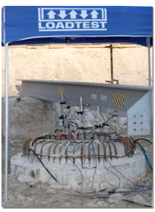
Pile head test arrangement showing reference beam during O-cell bi-directional loading in progress.