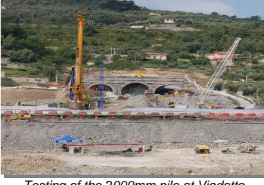
Testing of the 2000mm pile at Viadotto Imperia