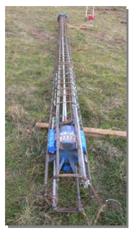
Reinforcing cage, O-cell and instrumentation ready for Installation