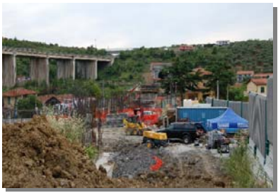
Testing of the 1400mm pile at Viadotto Caramagna