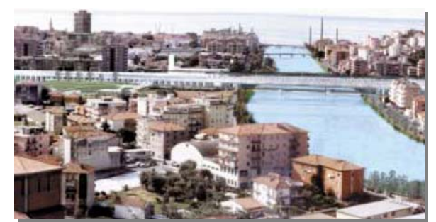
Artists impression of new railway track at Imperia

Successful testing of the limestone rock sockets on these three piles was achieved. In addition, the loading and unloading behaviour of the piles was required as if loaded in a traditional manner from the pile head and this modeled successfully using the measured components.